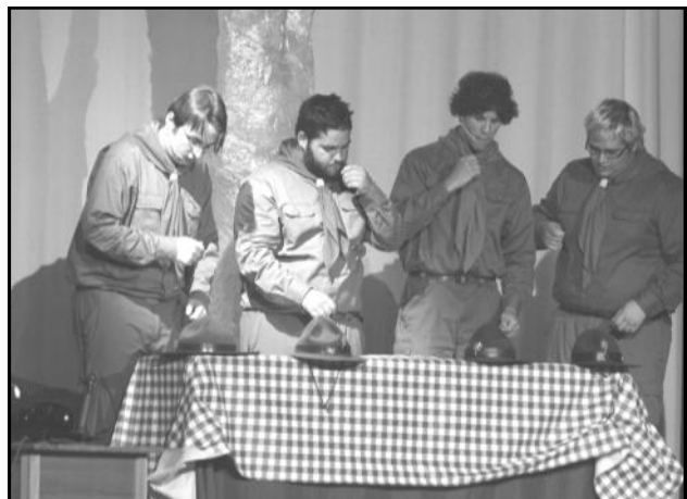
The first members of the Order of the Arrow discuss how they are going to run it.